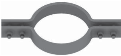
FOUR-BOLT SOCKET CLAMP FOR DI PIPE