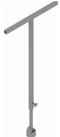
ADJUSTABLE GATE VALVE KEY