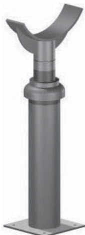
ADJUSTABLE PIPE SADDLE SUPPORT