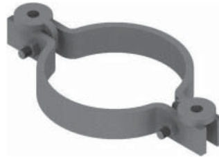
SOCKET CLAMP FOR DI PIPE