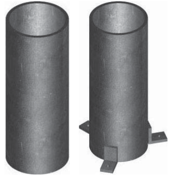
Shown with optional lugs.